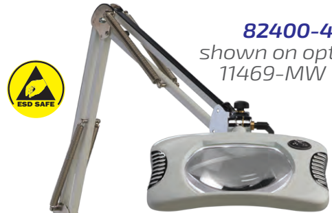
82400-4-MW shown on optional 11469-MW Base