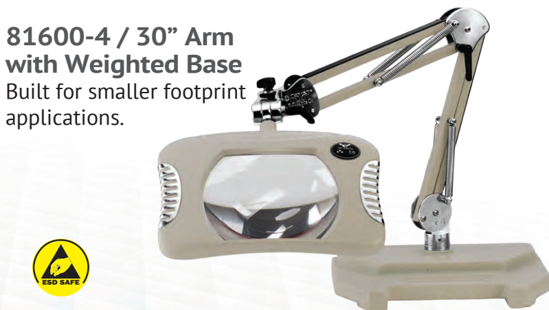
81600-4 / 30" Arm with Weighted Base Built for smaller footprint applications.

Roll your magnifier from task to task with ease. The No-Tip base features 6 large diameter caster wheels and a 35 lb. counter-weight for smooth and safe movement.