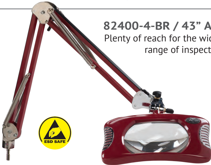
82400-4-BR / 43" Arm Plenty of reach for the widest range of inspection.